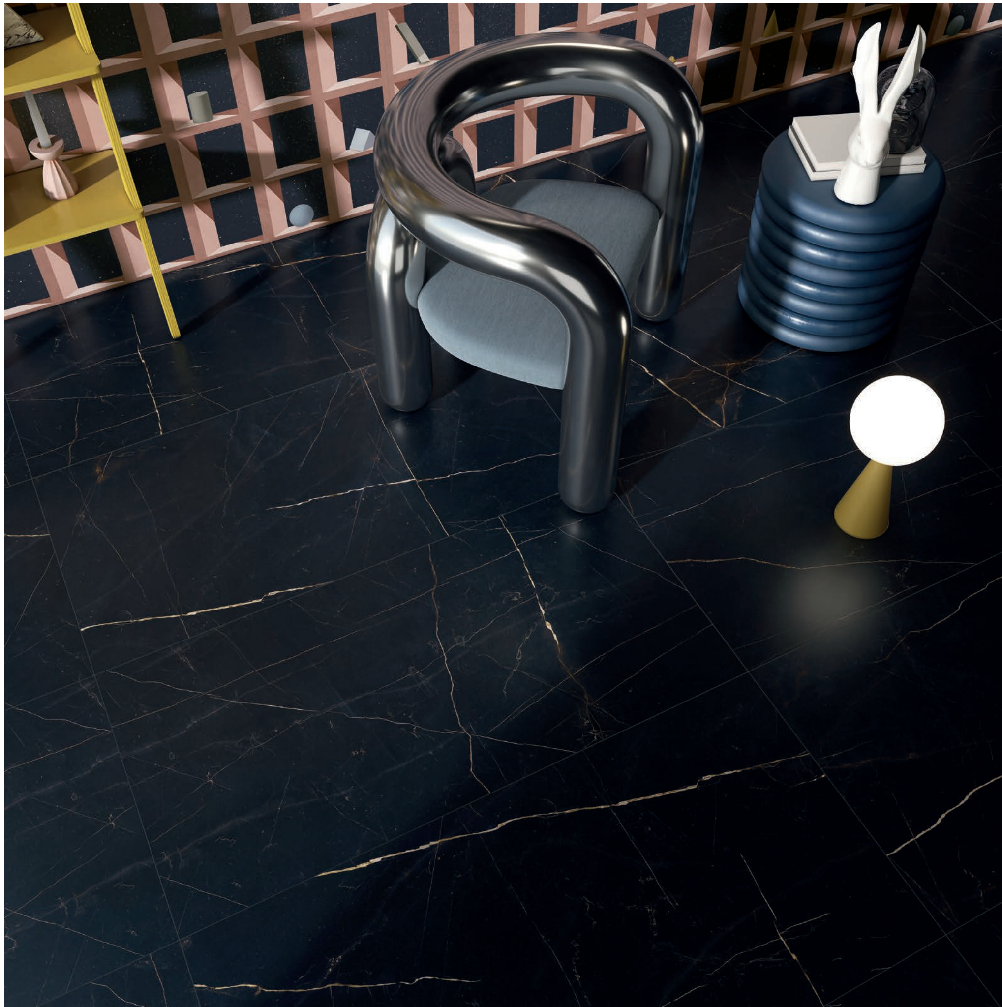
wall: WIDE&STYLE LUNAR 120x280 / floor: MARMI PRIMO PRECIOUS BLACK NAT. R. 60x120