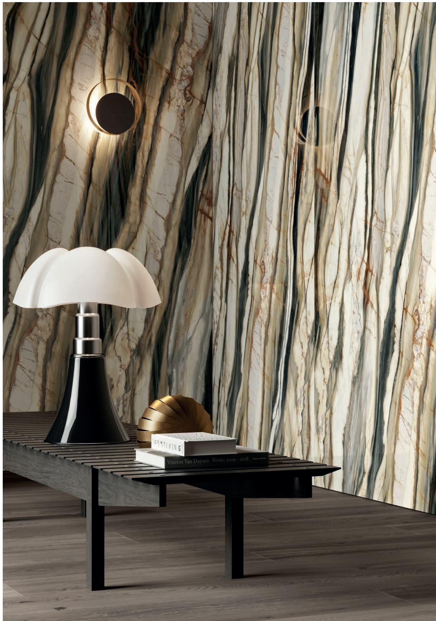
wall: MARMI PRIMO OYSTER GOLD LUX R. 120x280 / floor: VERSES WOOD MUD NAT. R. 26,5x180