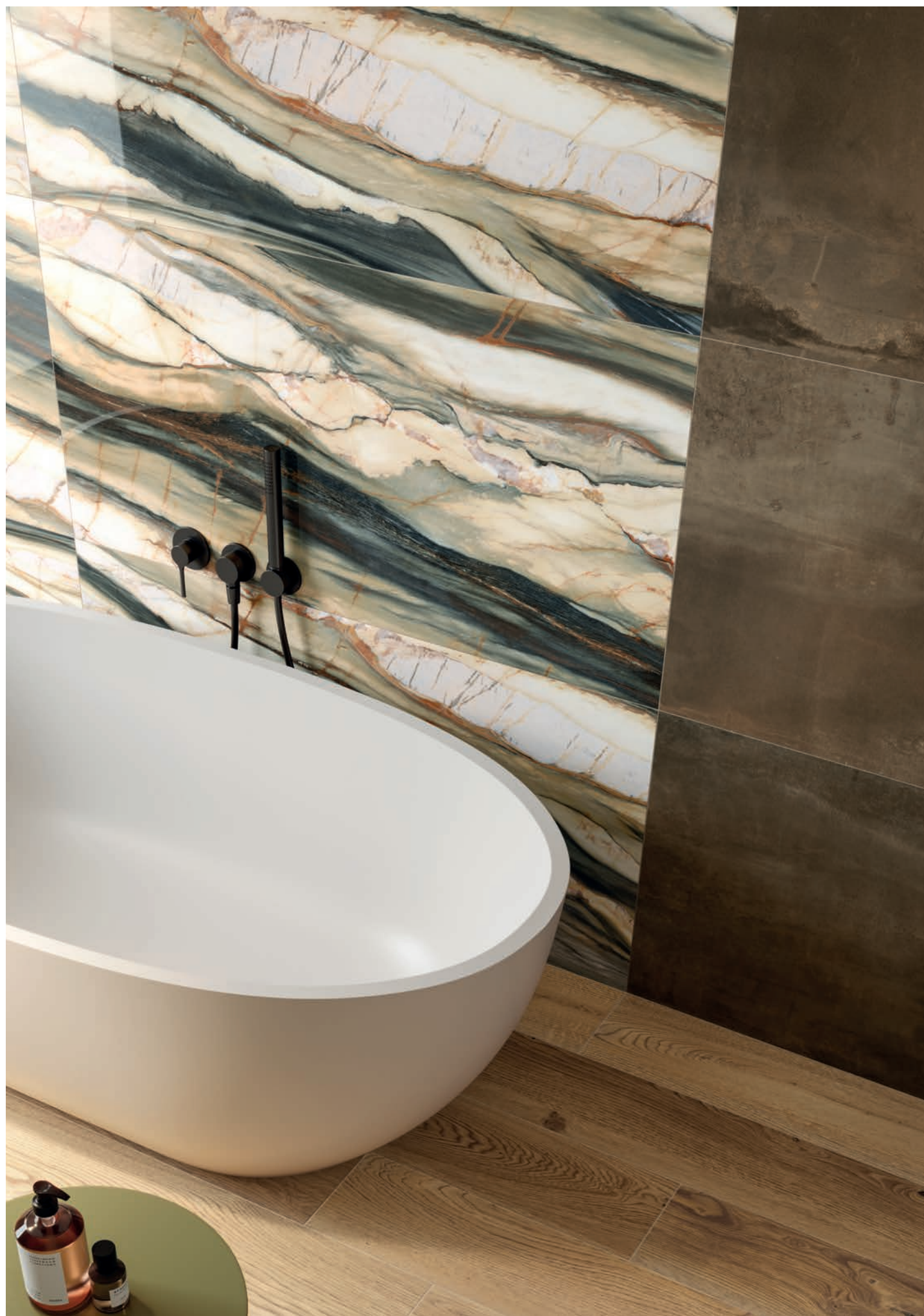
wall: MARMI PRIMO CARRARA SOFT R. 120x280 / floor: VERSES WOOD GOLD NAT. R. 20x120