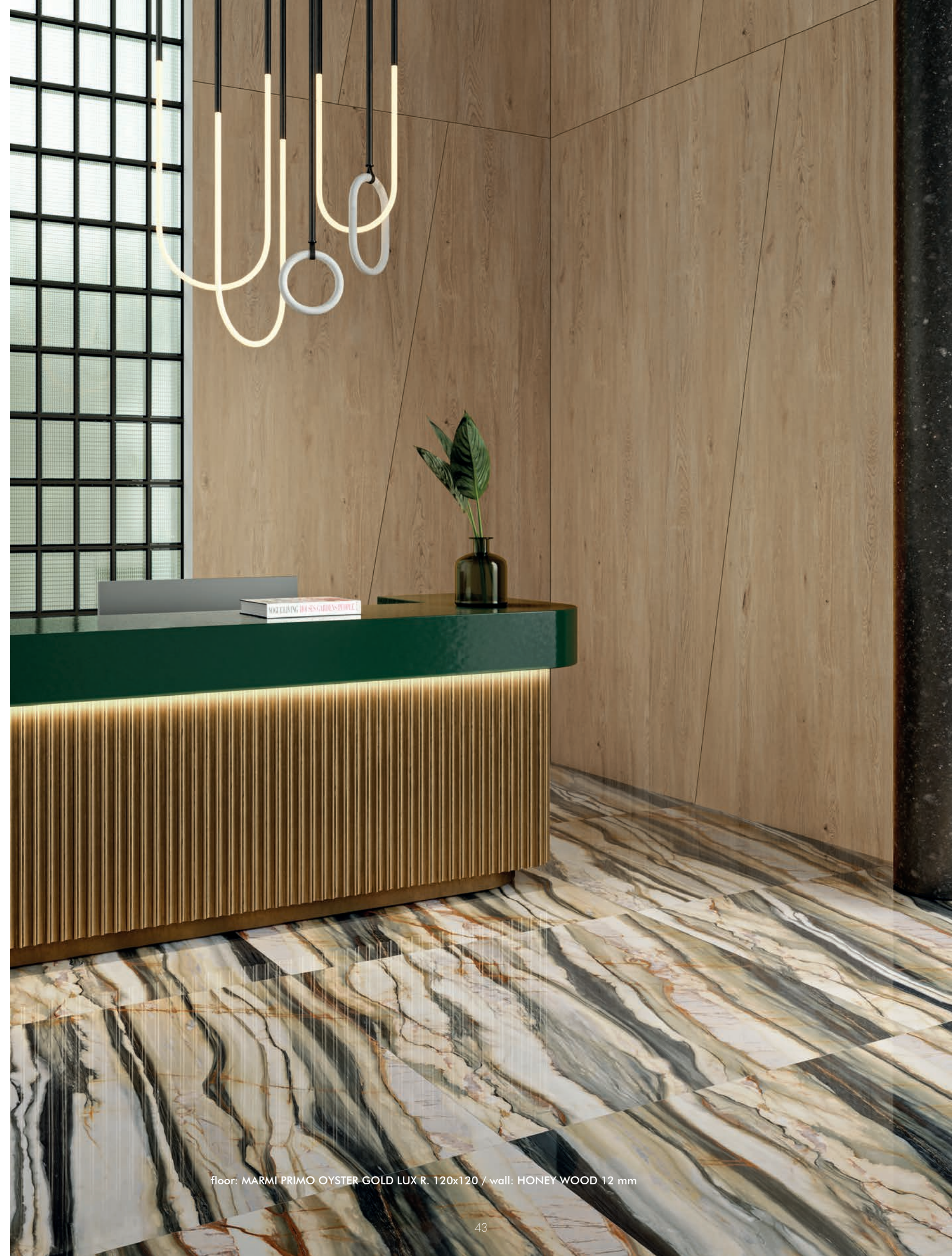
floor: MARMİ PRİMO OYSTER GOLD LUX R. 120x120 / wall: HONEY WOOD 12 mm