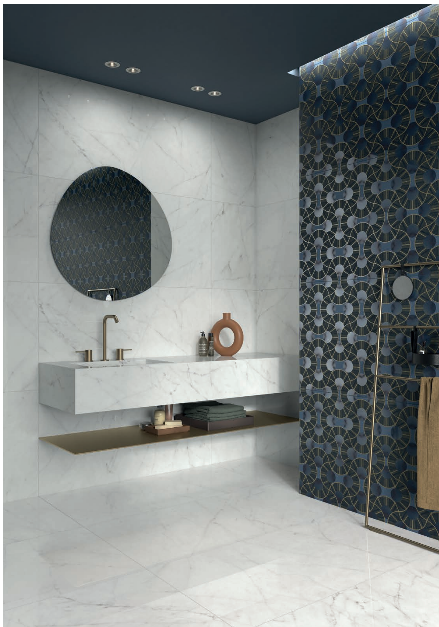
wall: MARMİ PRİMO CARRARA LUX R. 60x120+W&S MINI VOL.2 REFINED NAT. R.60x120 / floor: MARMİ PRİMO CARRARA LUX R. 60x120 washbasin: MARMİ PRİMO CARRARA LUX R. 120x280