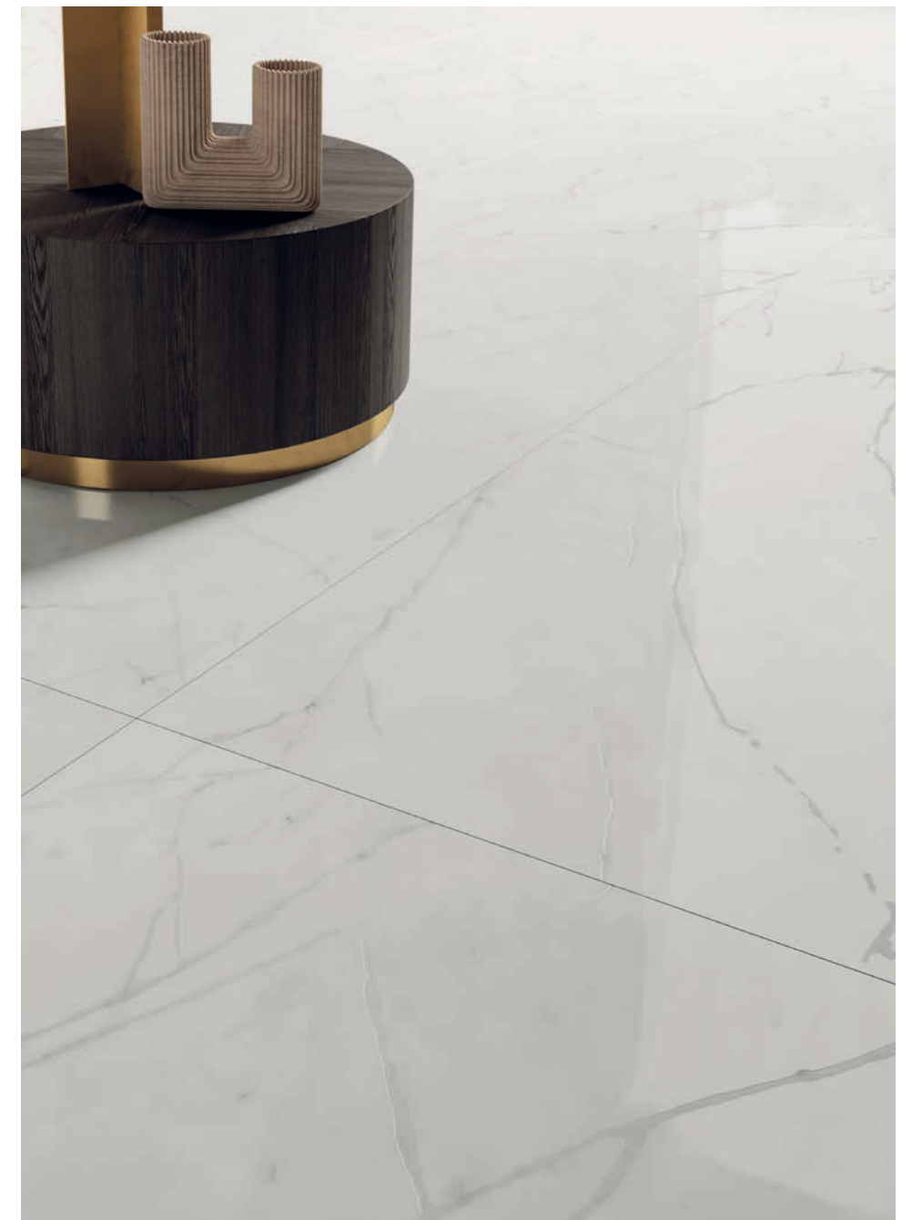
floor: MARMI PRIMO CARRARA ANT. 3D R. 60x120