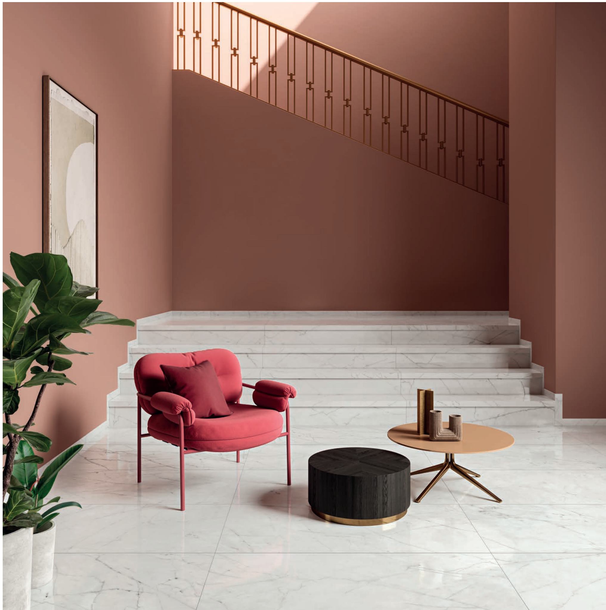
floor: MARMI PRIMO CARRARA ANT. 3D R. 60x120