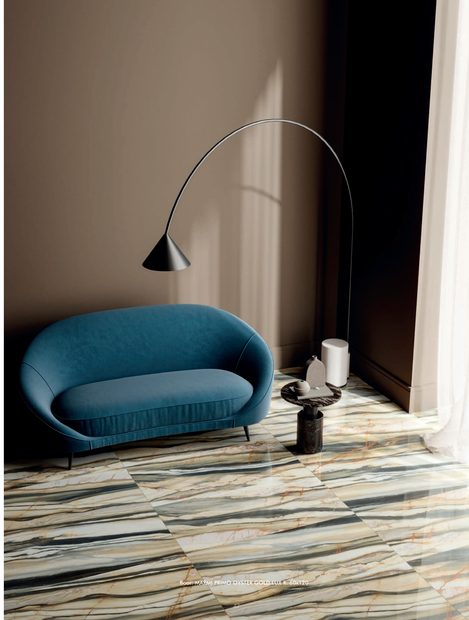
floor: MARMI PRIMO OYSTER GOLD LUX R. 60x120