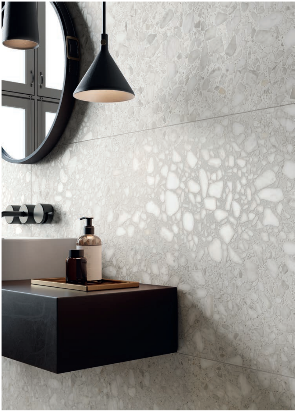
wall: MARMI PRIMO VENEZIA NUVOLA ANT. 3D R. 60x120