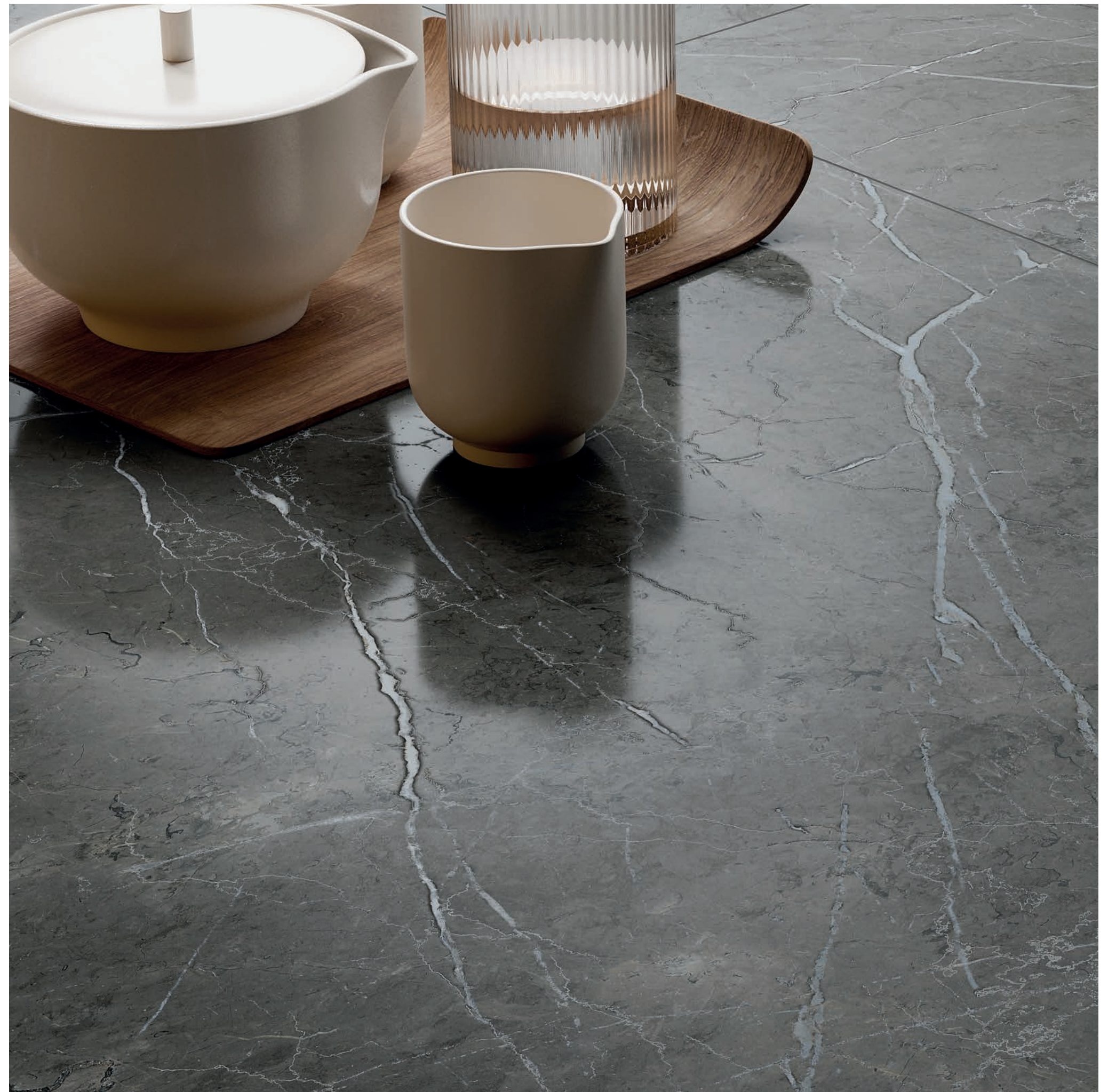
floor: MARMİ PRİMO STONE GREY ANT. 3D R. 120x120