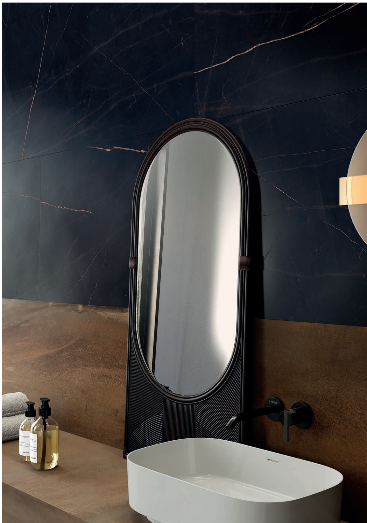
wall: MARMI PRIMO PRECIOUS BLACK ANT. 3D R. 60x120+INTERNO 9 RUST NAT. R. 60x120 washbasin top: INTERNO 9 RUST NAT. R. 120x280 / floor: MARMI PRIMO PRECIOUS BLACK ANT. 3D R. 60x120