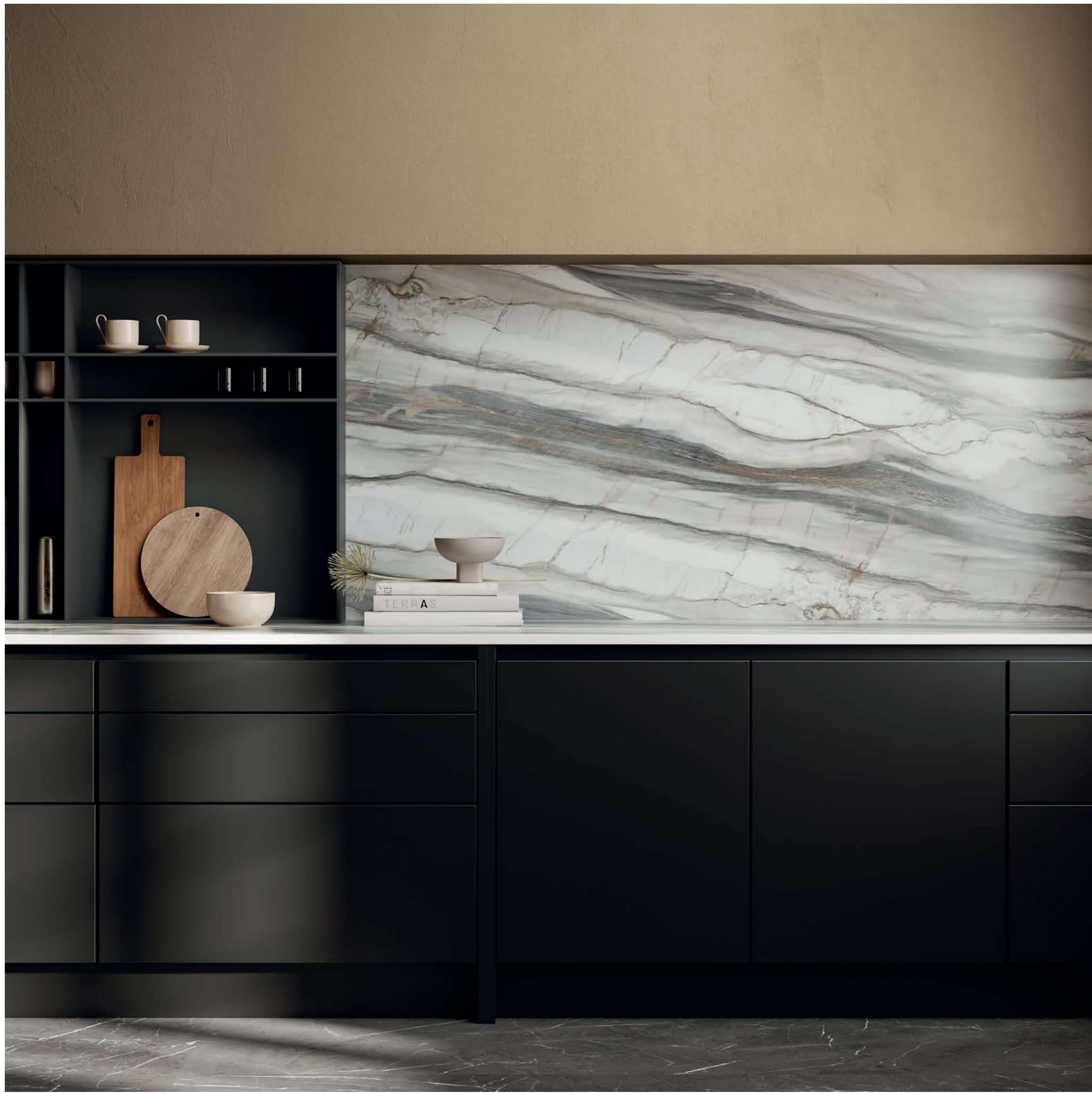
wall: MARMI PRIMO OYSTER WHITE SOFT R. 120x280 / floor: MARMI PRIMO STONE GREY ANT. 3D R. 120x120