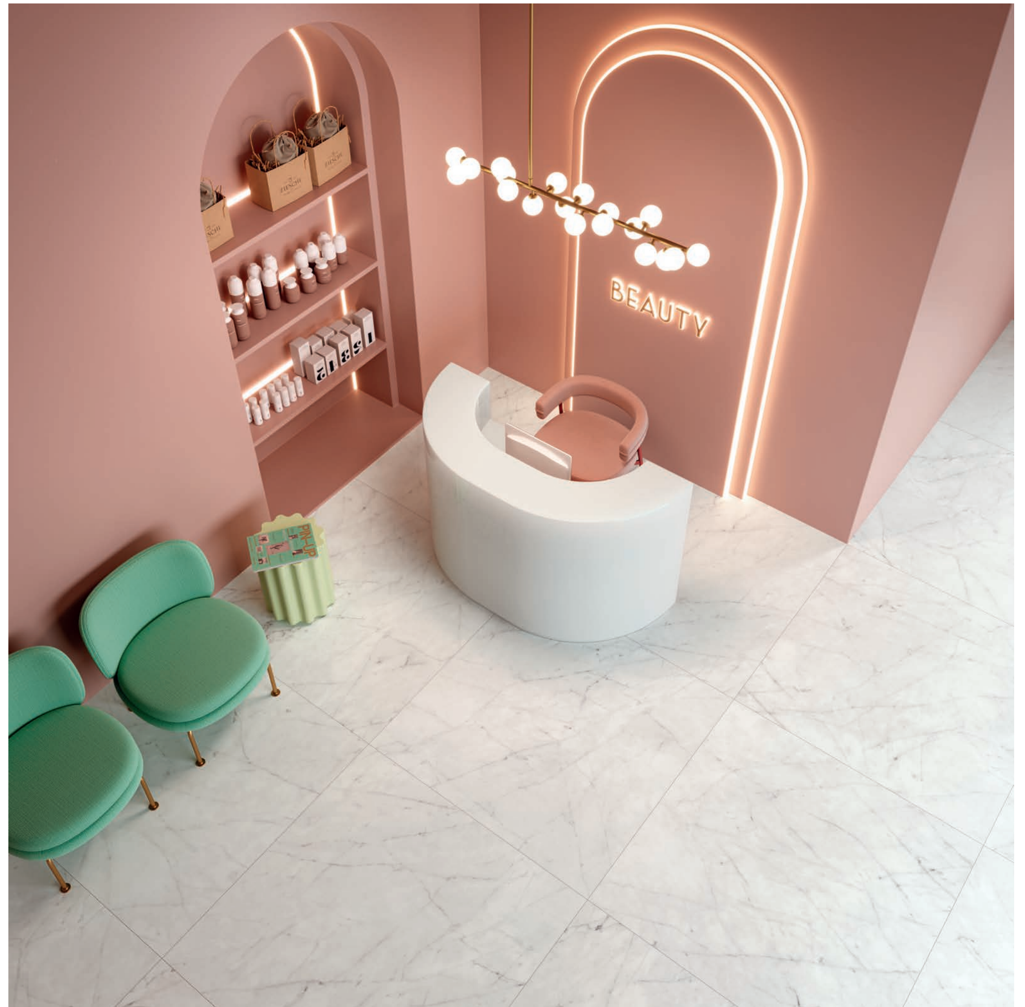
floor: MARMI PRIMO CARRARA NAT. R. 120x120