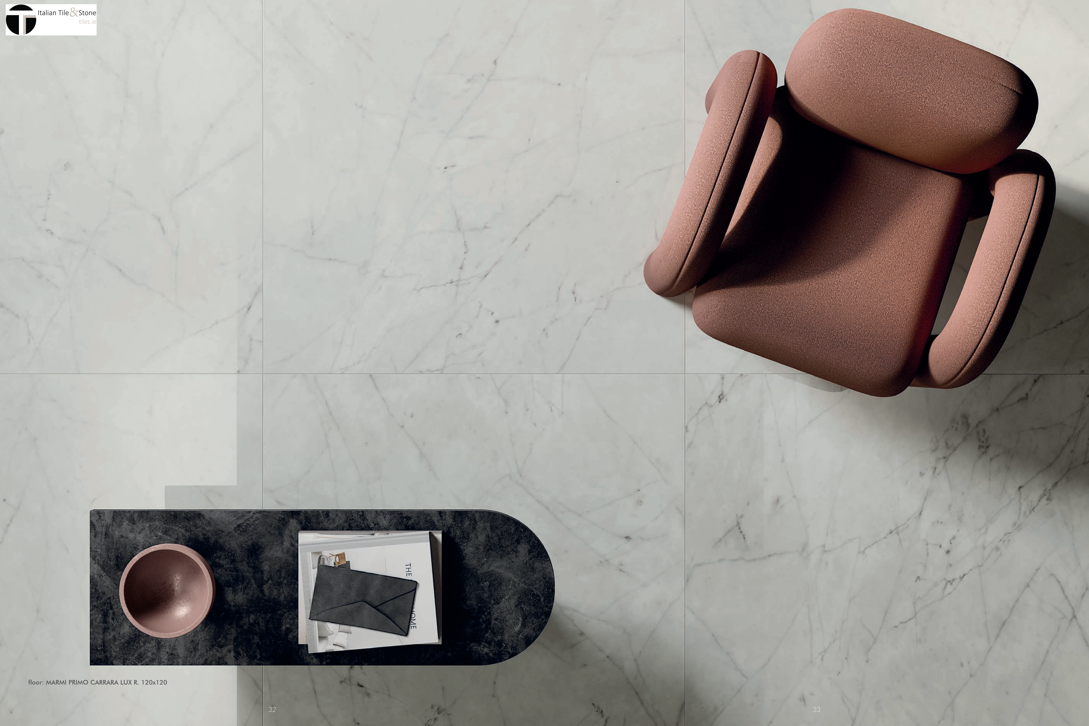
floor: MARMI PRIMO CARRARA LUX R. 120x120