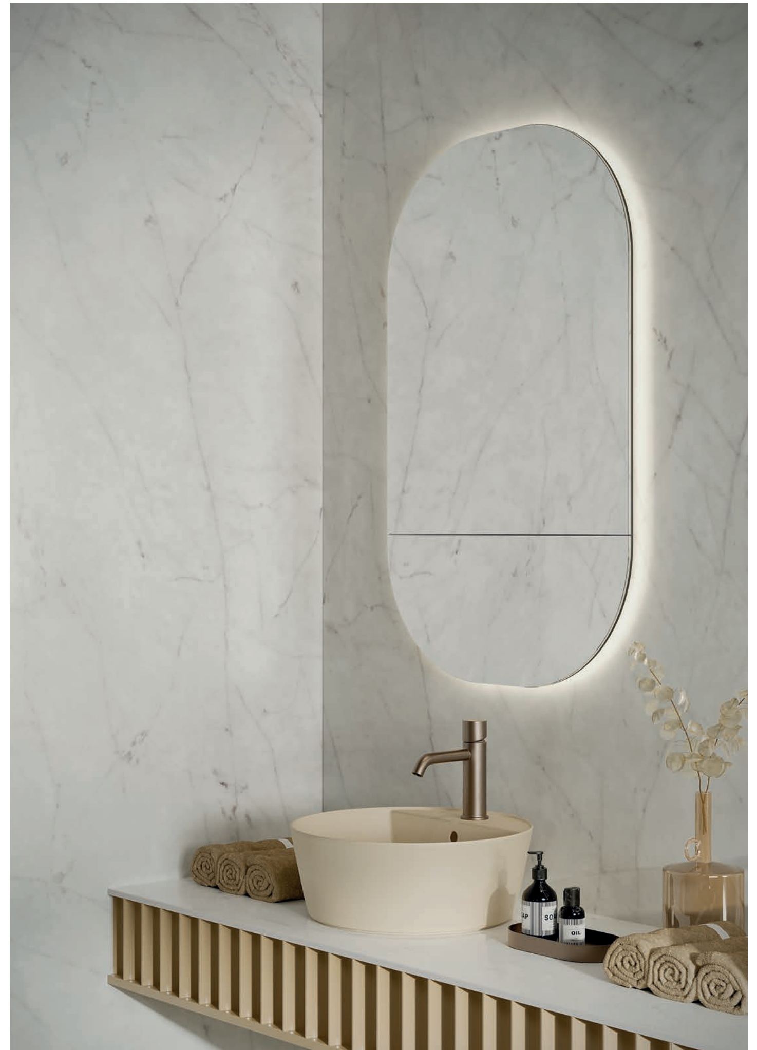
wall: MARMI PRIMO CARRARA SOFT R. 120x280 / floor: VERSES STONE PIRENEI GREY NAT. R. 60x120 washbasin: CARRARA SOFT 12 mm