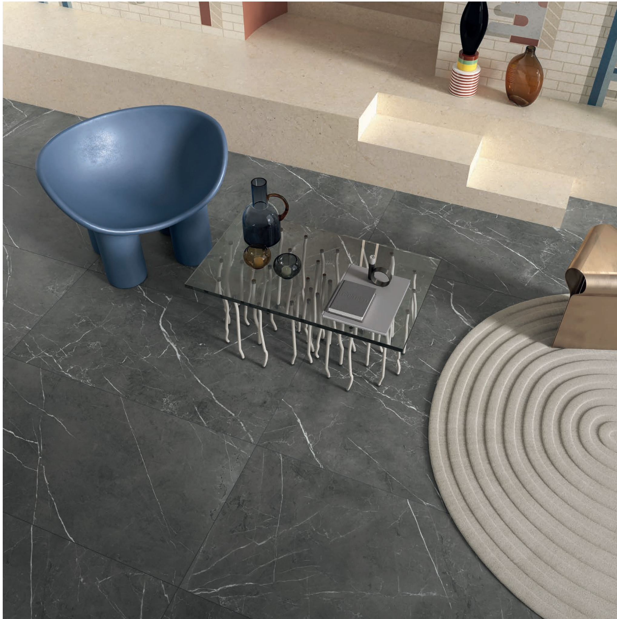
wall: WIDE&STYLE BRICKLANE 120x280 / floor: MARMI PRIMO STONE GREY NAT. R. 60x120