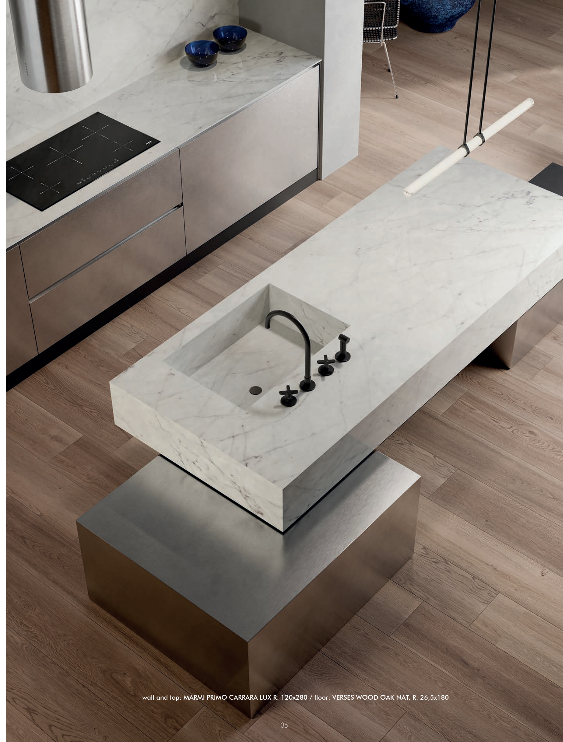
wall and top: MARMİ PRİMO CARRARA LUX R. 120x280 / floor: VERSES WOOD OAK NAT. R. 26,5x180