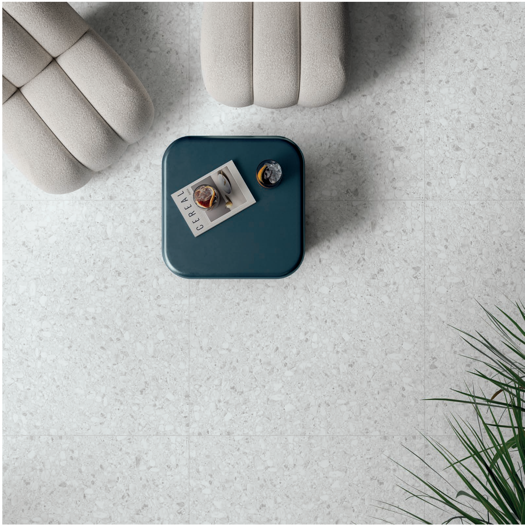
floor: MARMI PRIMO VENEZIA NUVOLA ANT. 3D R. 120x120