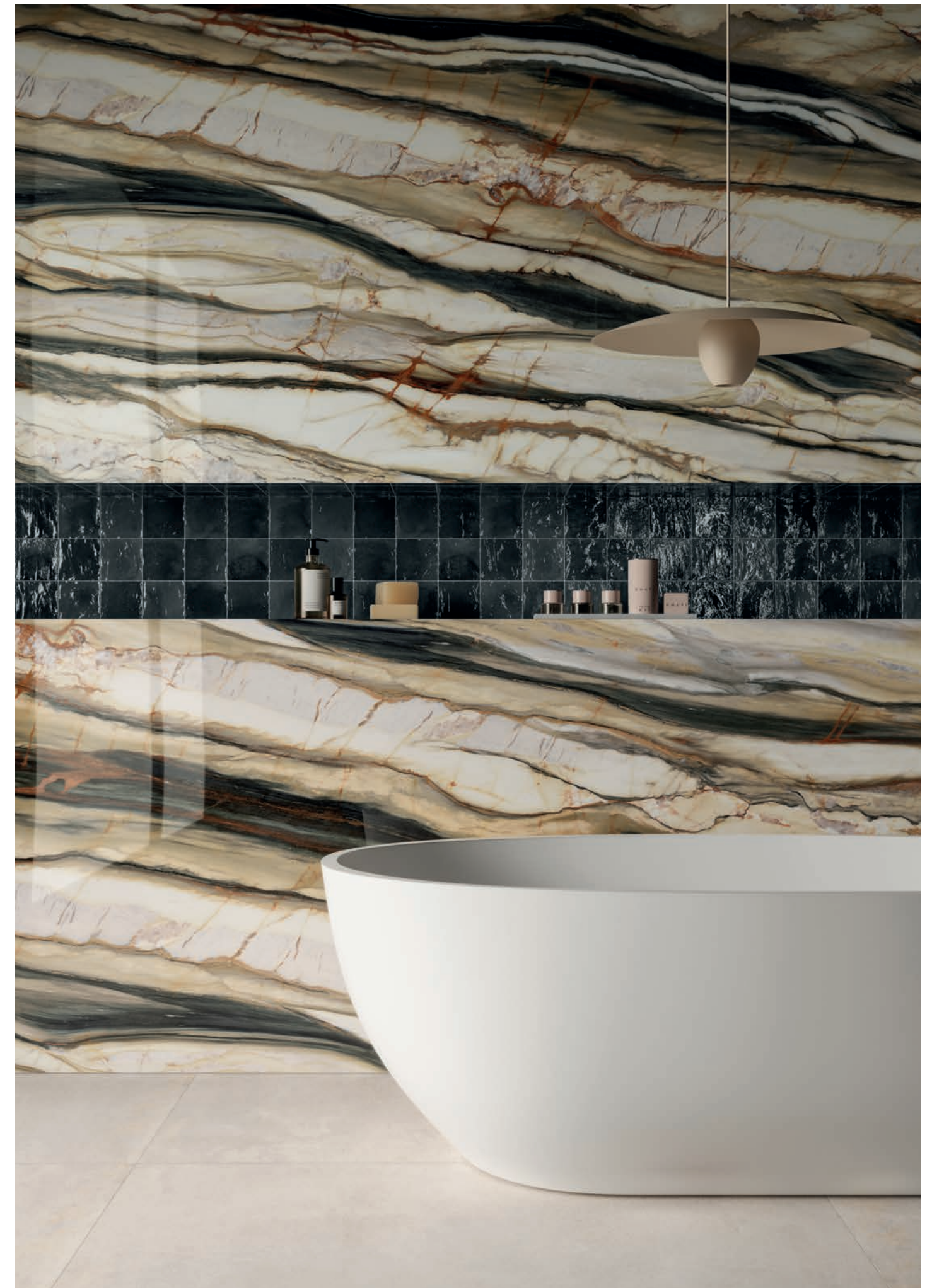
wall: MARMI PRIMO OYSTER GOLD LUX R. 120x280+VERSES COLORS SMOKE 10x10/ floor: BLEND CONCRETE MOON NAT. R. 60x120