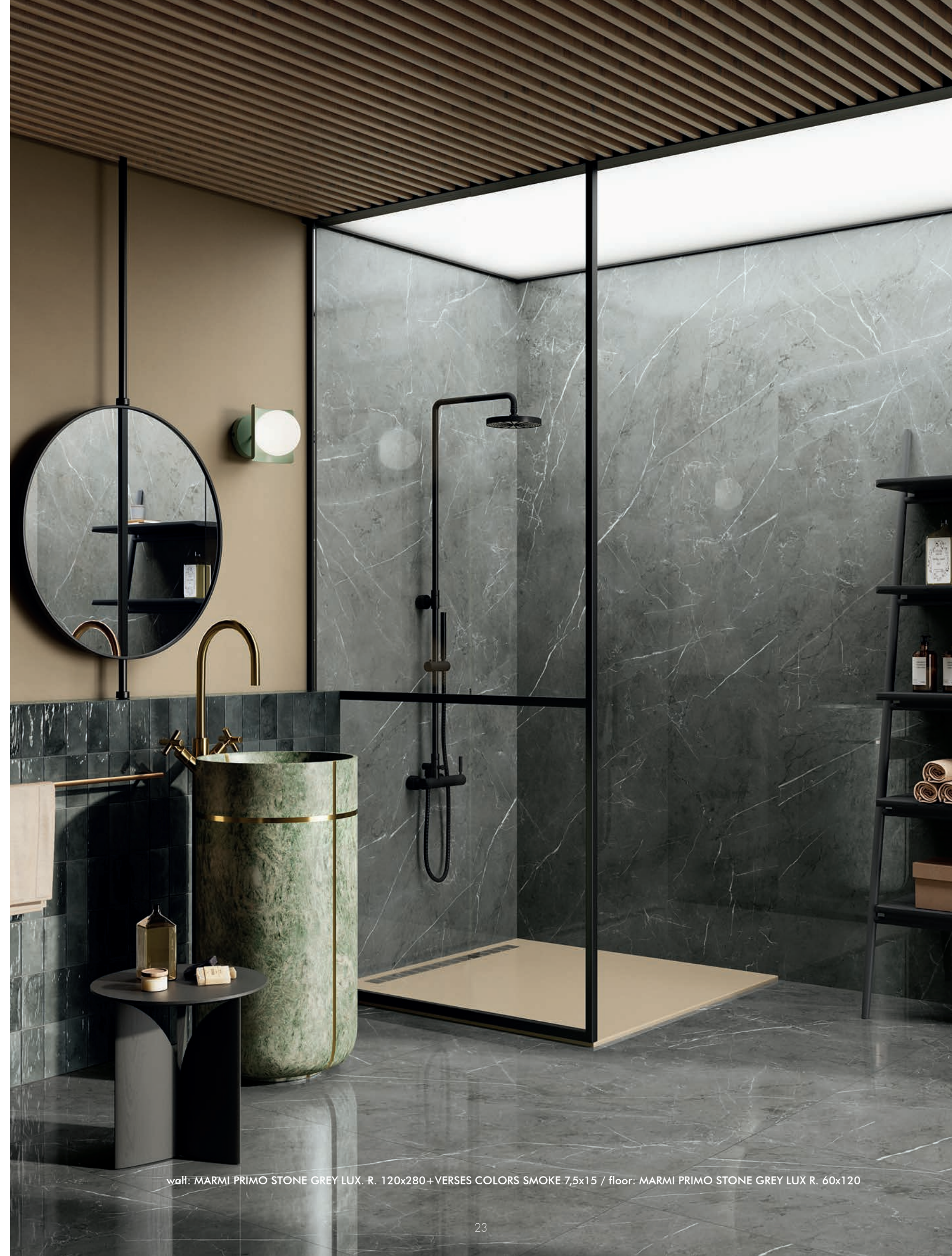
wall: MARMI PRIMO STONE GREY LUX. R. 120x280+VERSES COLORS SMOKE 7,5x15 / floor: MARMI PRIMO STONE GREY LUX R. 60x120