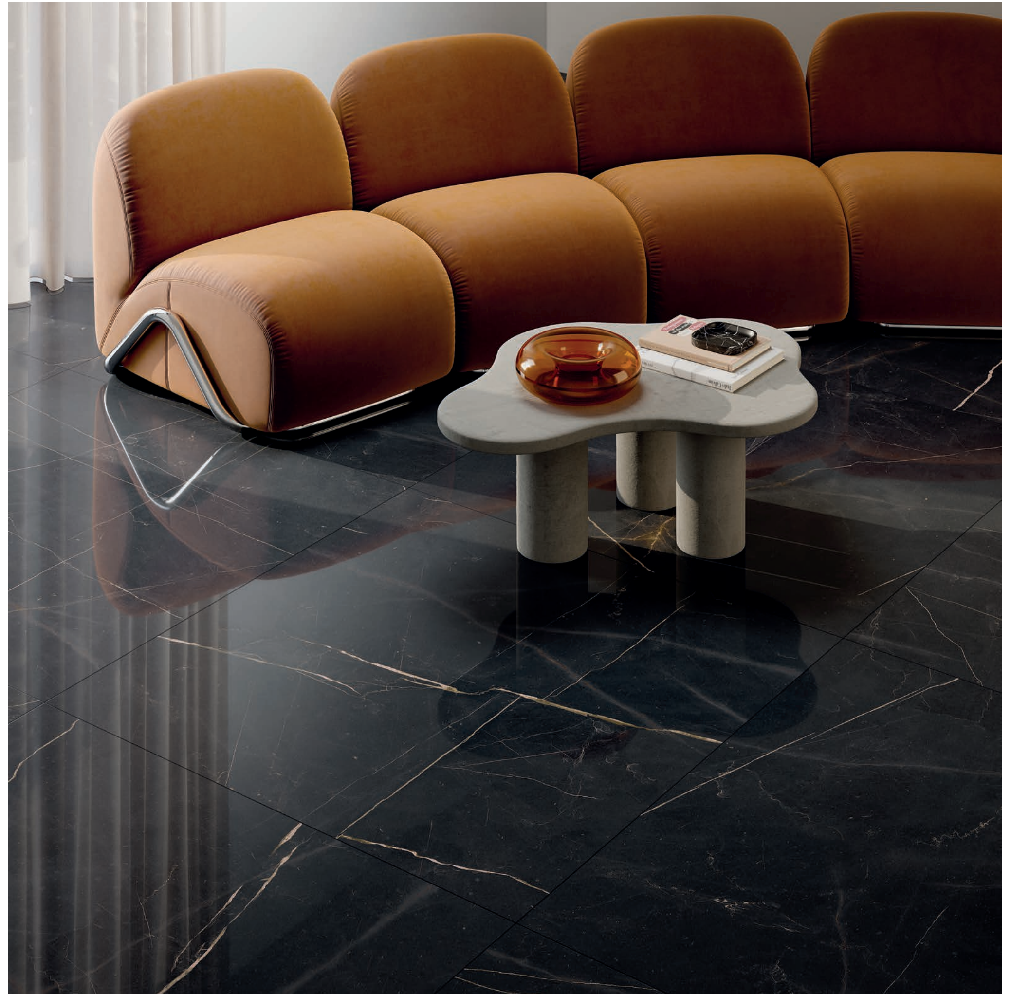
floor: MARMİ PRİMO PRECIOUS BLACK LUX R. 120x120