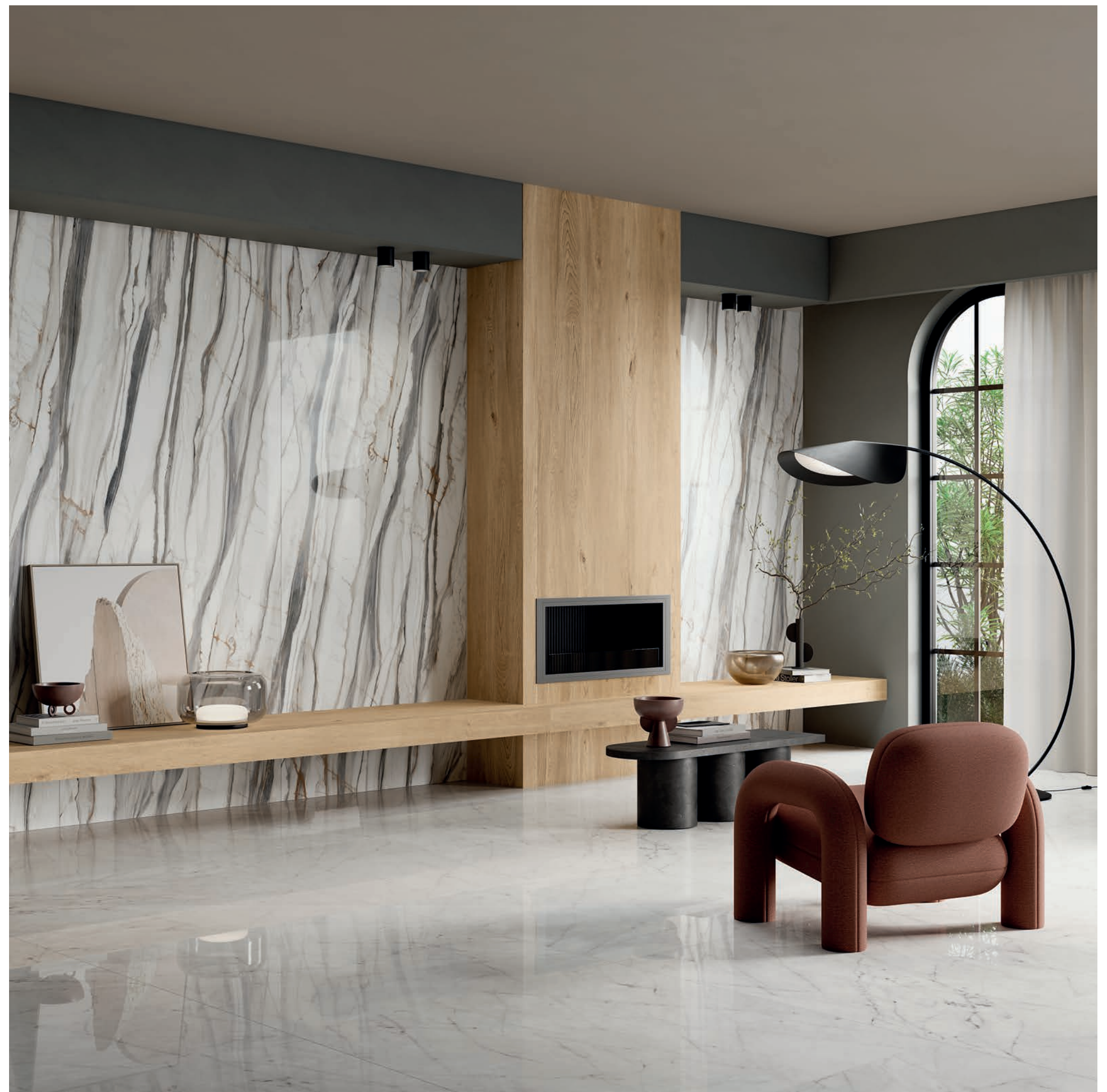
wall: MARMI PRIMO OYSTER WHITE LUX R.120x280+HONEY WOOD 12mm / floor: MARMI PRIMO CARRARA LUX R.120x120