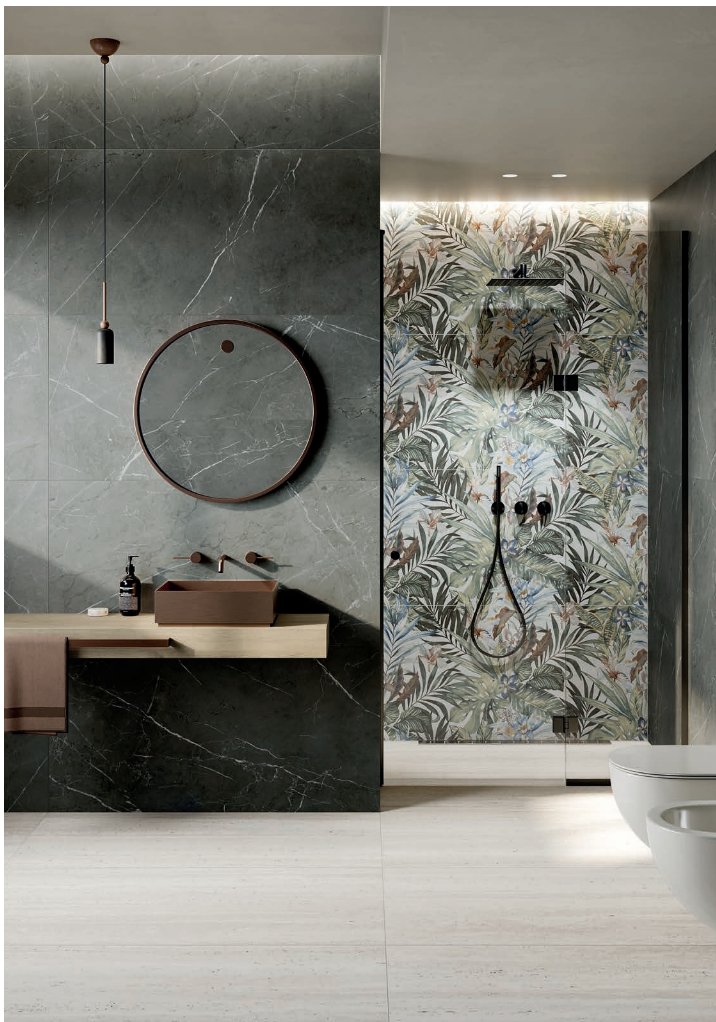
wall: MARMI PRIMO STONE GREY NAT. R. 60x120+WIDE&STYLE MINI CARIBBEAN NAT. R. 60x120 / floor: SENSI ROMA WHITE NAT. R. 60x120