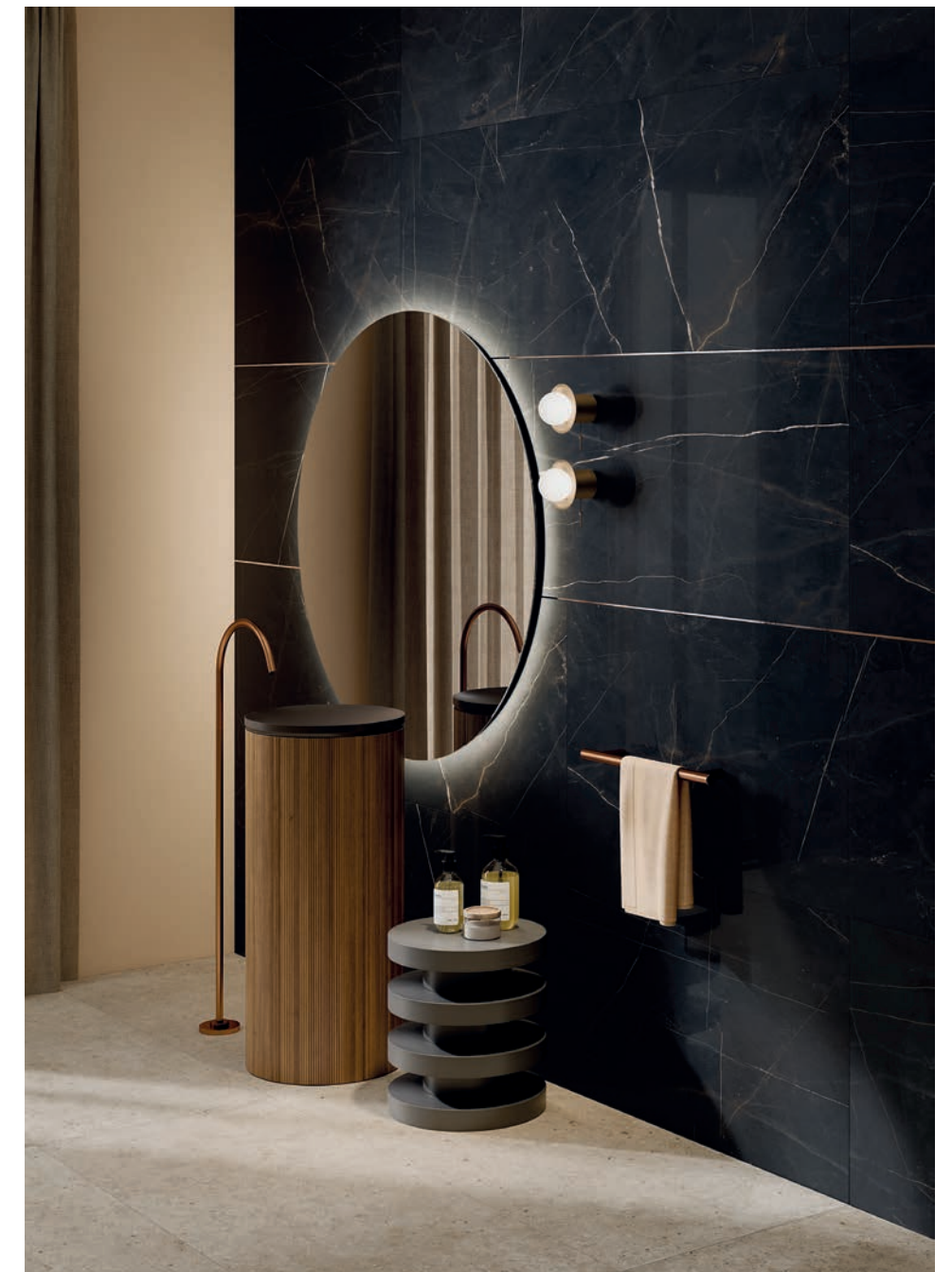
wall: MARMI PRIMO PRECIOUS BLACK LUX R. 60x120+MAT. ALLUMINIO RAME SCURO floor: VERSES STONE PIRENEI ECRU NAT. R. 60x120