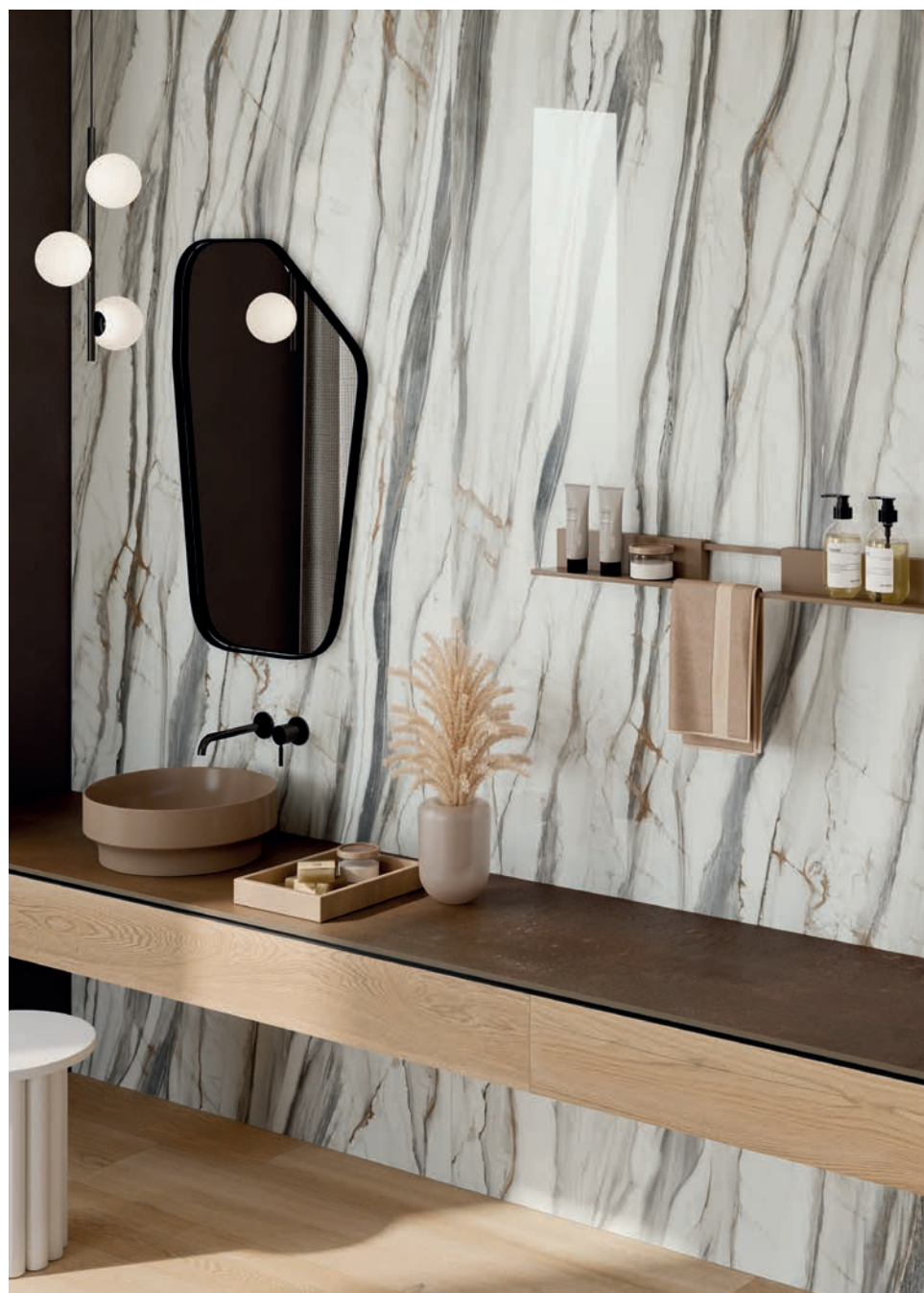
wall: MARMI PRIMO OYSTER WHITE LUX R. 120x280 / washbasin top: INTERNO 9 RUST 12 mm floor: VERSES WOOD GOLD NAT. R. 20x120