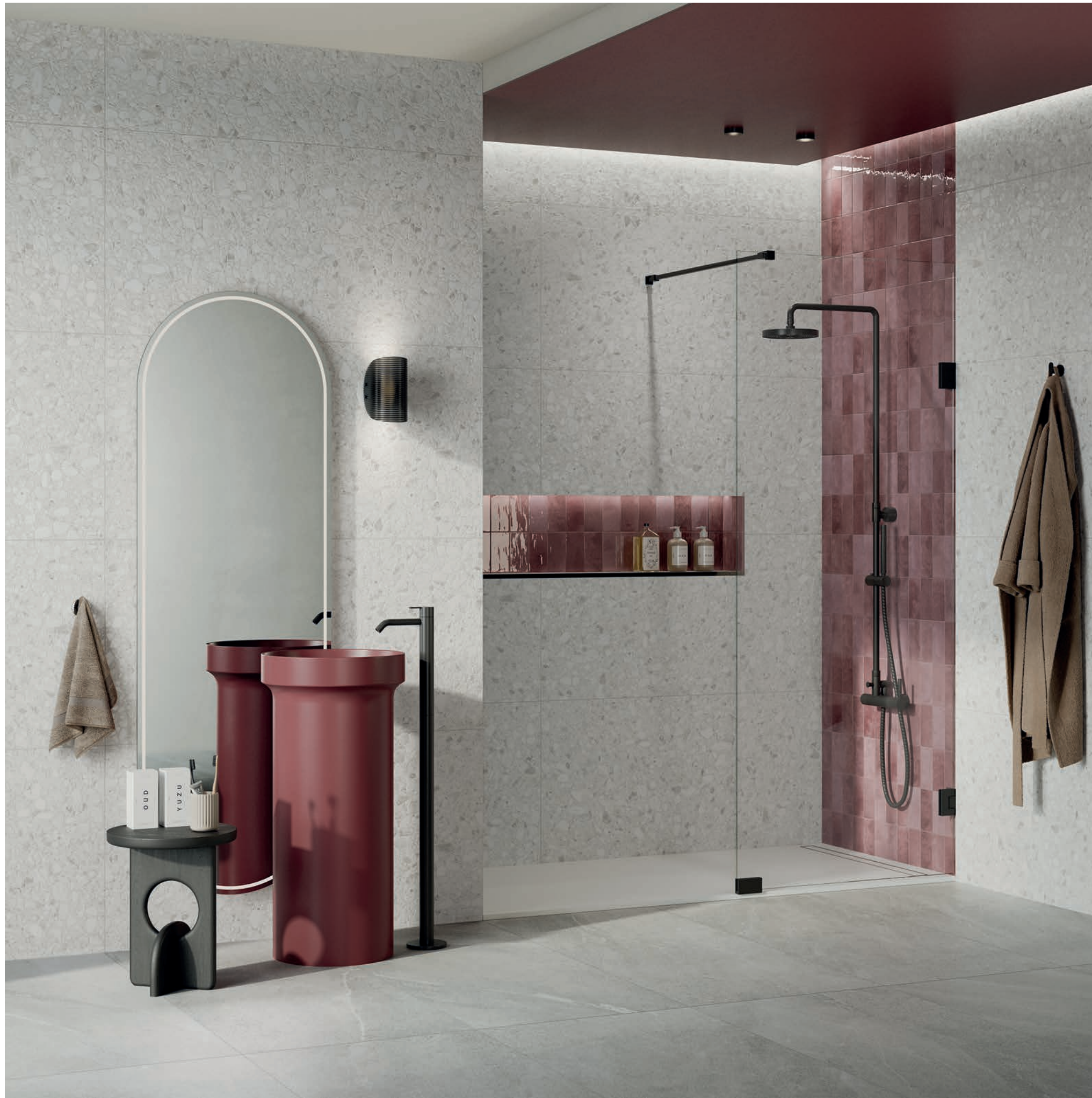
wall: MARMI PRIMO VENEZIA NUVOLA ANT. 3D R. 60x120+VERSES COLORS BLUSH 7,5x15 / floor: VERSES STONE PIASE ASH NAT. R. 60x120