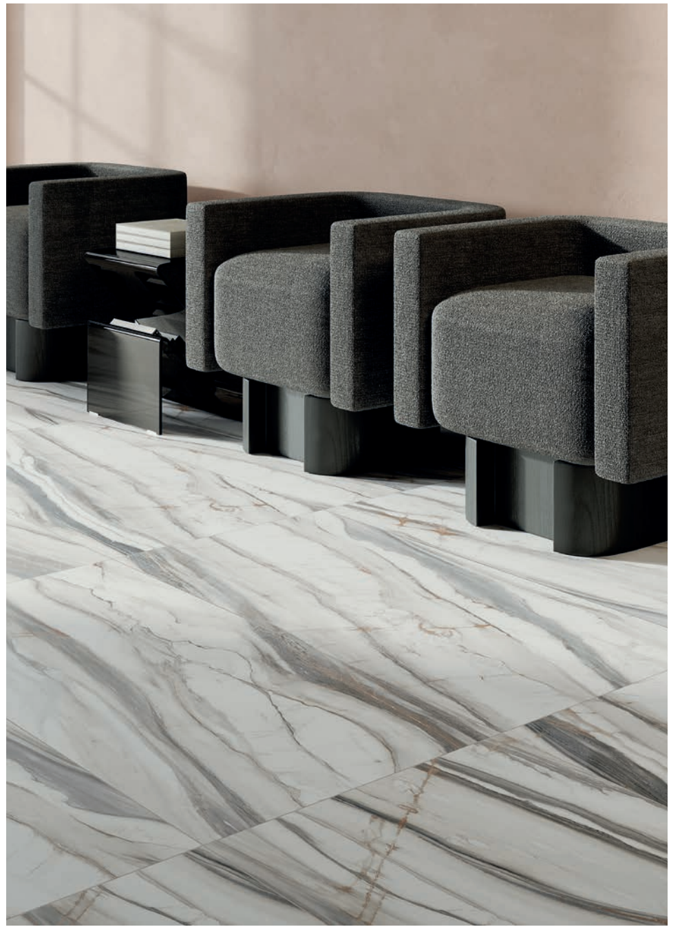
floor: MARMI PRIMO OYSTER WHITE NAT. R. 60x120