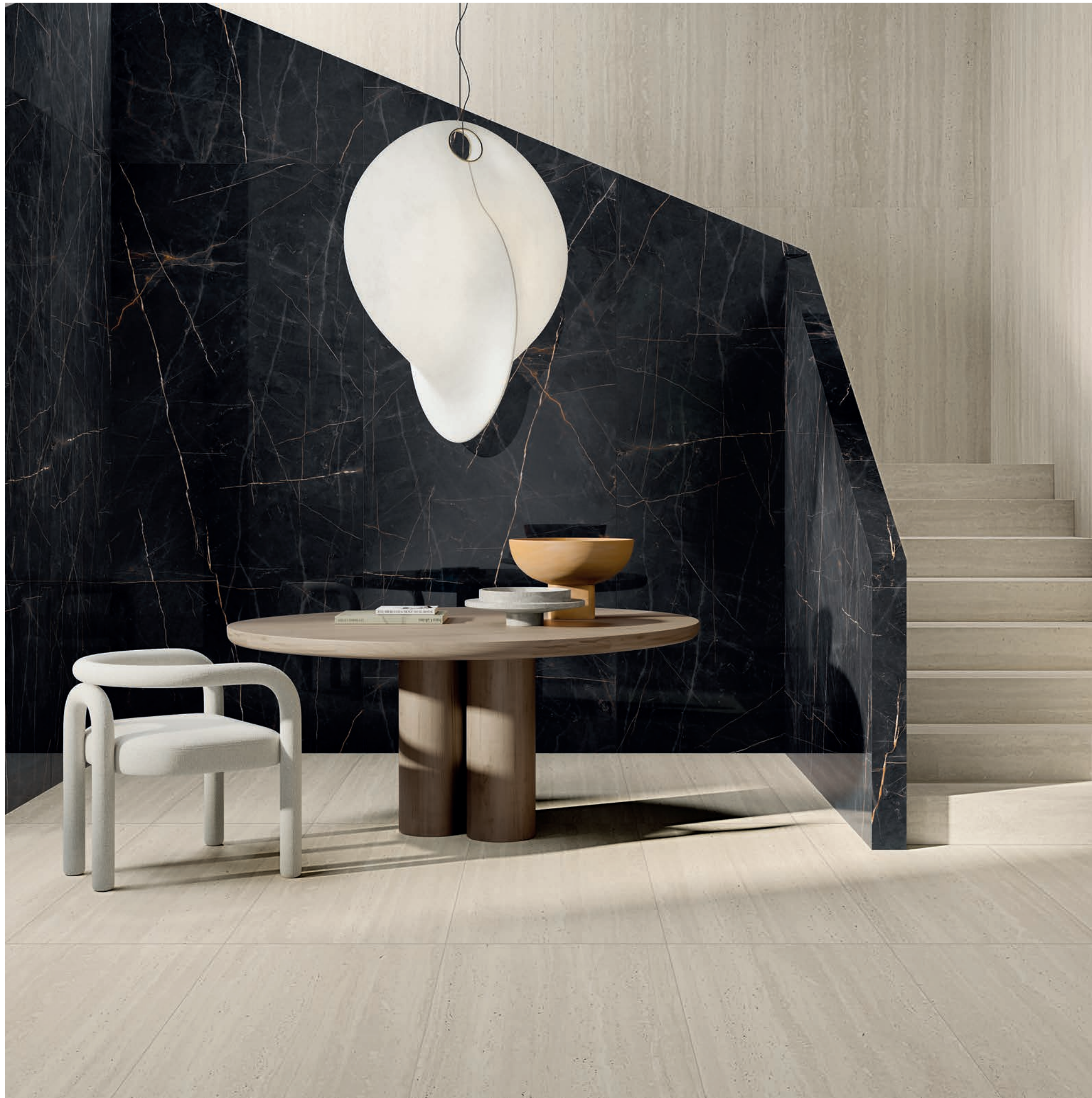
wall: MARMI PRIMO PRECIOUS BLACK LUX R. 120x280+SENSI ROMA IVORY NAT. R. 120x280 floor: SENSI ROMA IVORY NAT. R. 60x120